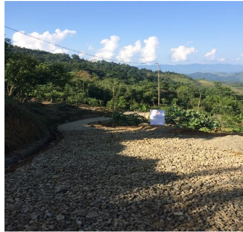
Campus Link Road (on going work)