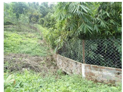
Campus Fencing (Security Fencing)