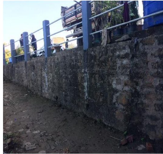
Protection wall above basement floor