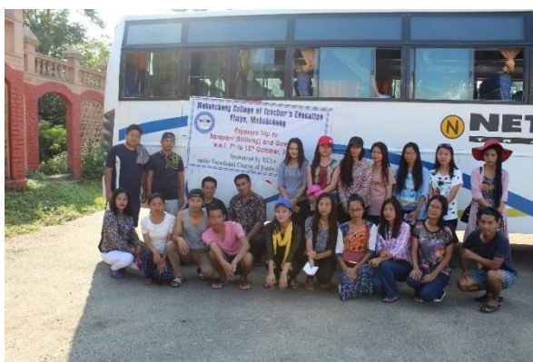
B.Ed 3 rd Semester (2016-18 batch) horti student exposure trip w.e.f. 7 th -12 th Oct 2017

An amount of ₹ 29,000/- (Rupees twenty nine thousand) only was hand over to the General Secretary MCTE Students’ Union for the purpose of utilization during field trip of 4 th semester (final) student of 2016-18 batch in the month of January, 2018. The above mentioned amount could be made possible through “ Workshop on Fruit Preservation ” in which produces fruit juice (banana, pineapple, guava) fruit jelly, fruit jam, chilly pickle and tomato sauce.