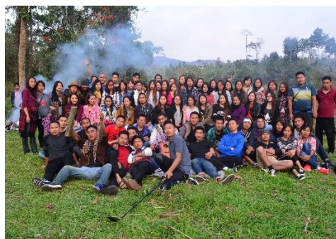
College picnic on 17 th March '17 at Satsu Village, Mokokchung