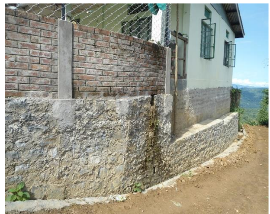
Protection wall around college (Principal Quarter)