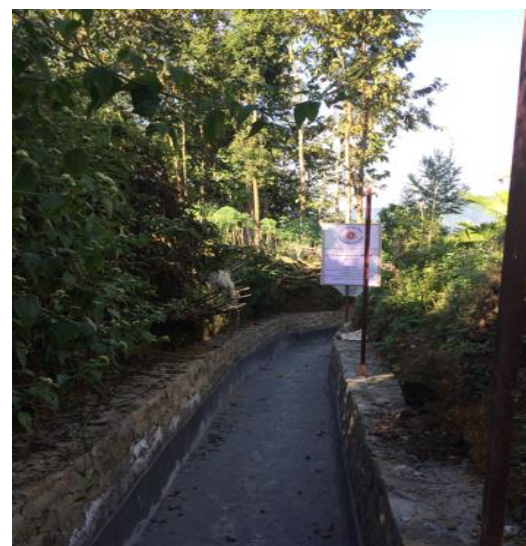
Culvert along with Storm Water Drain