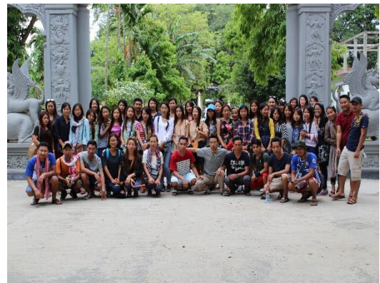
Field Trip to Majuli (Assam) on 18 th -19 th May 2017