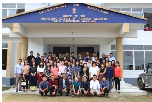
2017 Freshers' Day on 4 th July '17