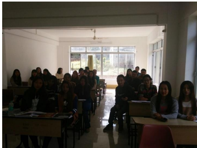
First batch of Horticulture students’ (theory class on going) w.e.f 1 st July 2017 and the session end in the month of December 2017

The proposed syllabus of “Horticulture as Vocational Course of Study” was initiated by MCTE, Yimyu-Mokokchung and approved by Nagaland University (NU-Lumami). The title of the course is “Fundamentals of Horticulture and Crop Production” . This course of study is introduced to 3 rd semester B.Ed students (2016-18 batch) and activated the course at MCTE, Yimyu Mokokchung w.e.f 1 st July 2017.