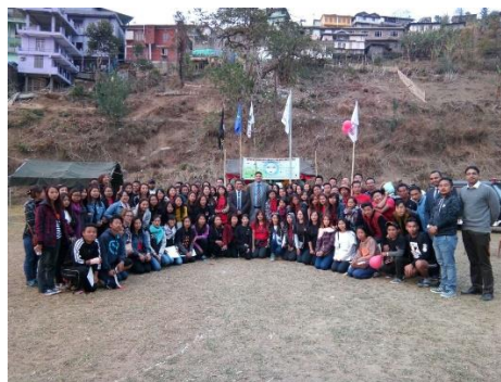
College Sports Week at AR Ground, Mokokchung w.e.f. 7 th – 9 th March '17