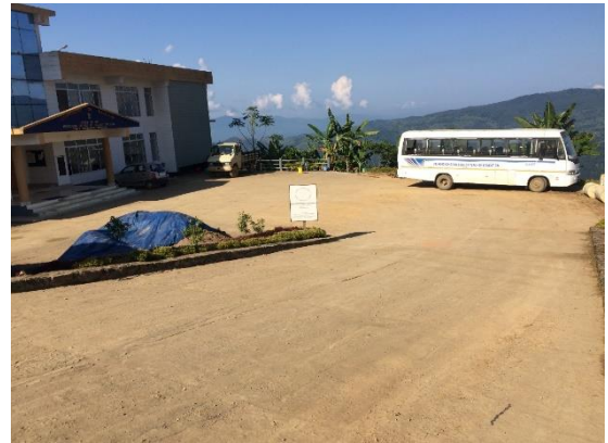
Campus Flooring (Parking Lot)