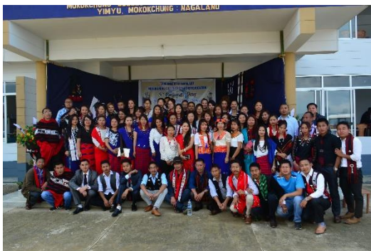
MCTE Cultural Day on 3 rd May '17