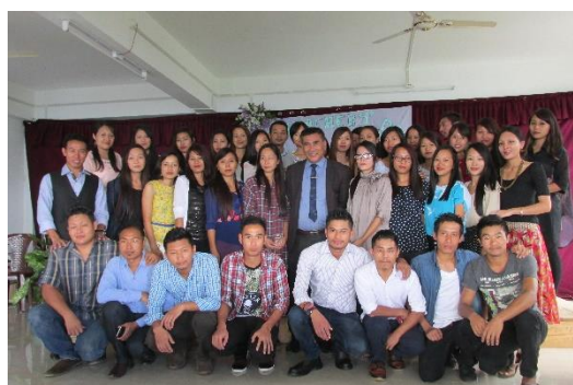
Pre-Teachers' Day celebration on 4 th Sept. '17