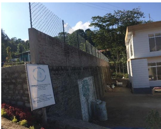
Protection wall along with fencing between play court and college building