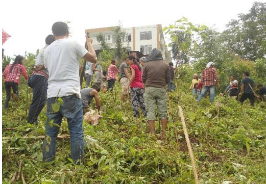
Mass social work on 4 th March 2017