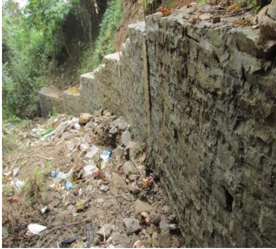
Protection wall against rivulet