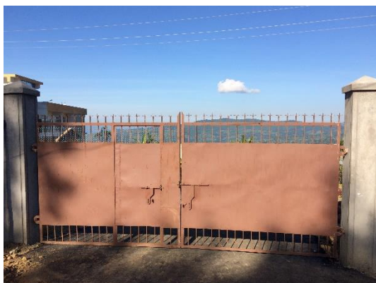
MCTE Main Gate

The college constructed 2 (two) iron gates with an amount of ₹ 87,000/- (Rupees eighty seven thousand) only from the fee collected for college development (college internal fund).