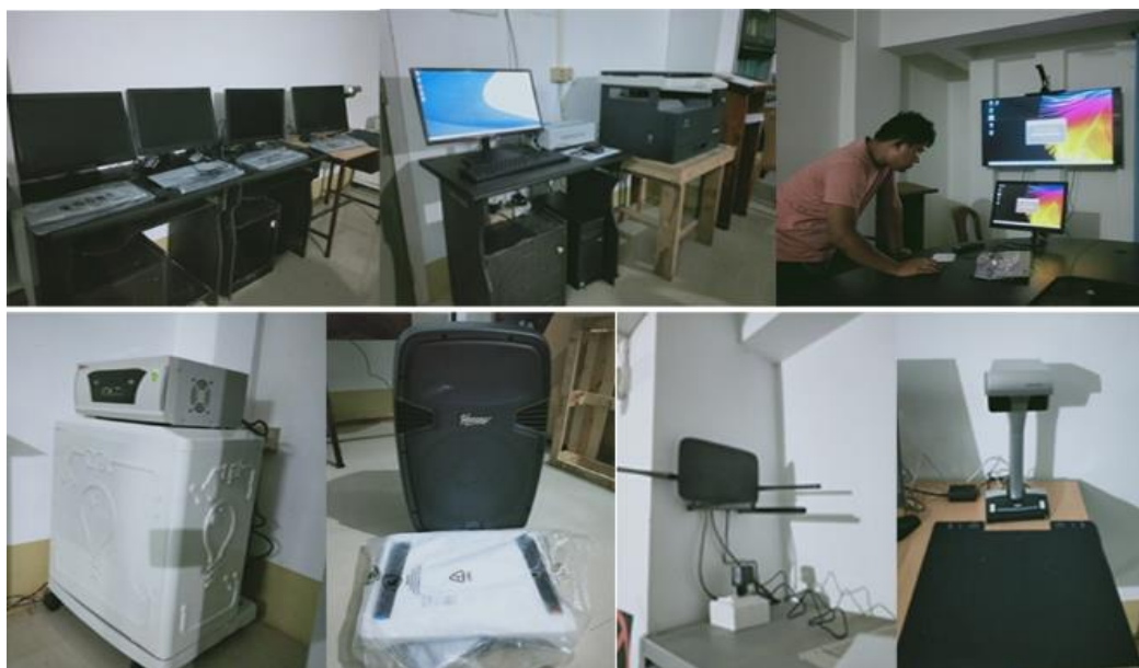
Items received under “Library Digitization Project