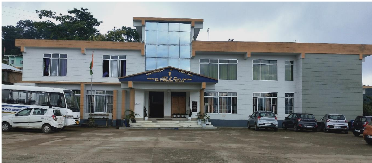
MCTE Academic cum Administrative Building

Name of the College : Mokokchung College of Teacher Education Address : Yimyu Ward, Mokokchung, Nagaland-798601 Official E-mail Id : mcte.nagaland@gmail.com Official Website : www.mcte-nagaland.in Ph. No : 0369-2225441