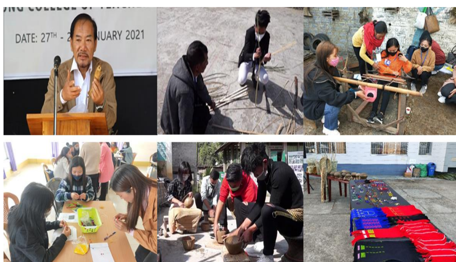
2 – Day Workshop on Weaving, Bamboo Craft, Pottery & Beadwork