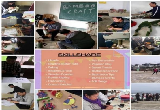
Skill Share "Learn from Me"