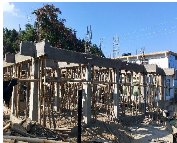
New Academic Building (under construction)

Established on 22 nd Feb 2012 by the Government of Nagaland (Department of Higher Education) Mokokchung College of Teacher Education, is the second Secondary Teacher Education Institution in the state. The College is located at Yimyu, Mokokchung, in a campus area of 5 acres. The Administrative building, inaugurated in 2014, is presently being used for both Administrative and Academic purposes. The Academic Building was sanctioned during the Financial Year 2020-21 and the construction is ongoing.