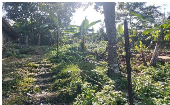
Barbed Fencing along the boundary of College land