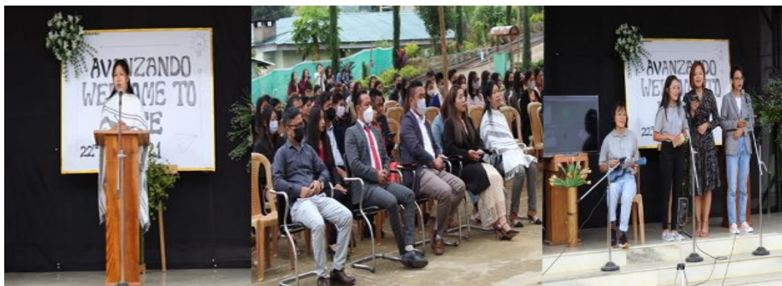
10 th Freshers' Meet 2021