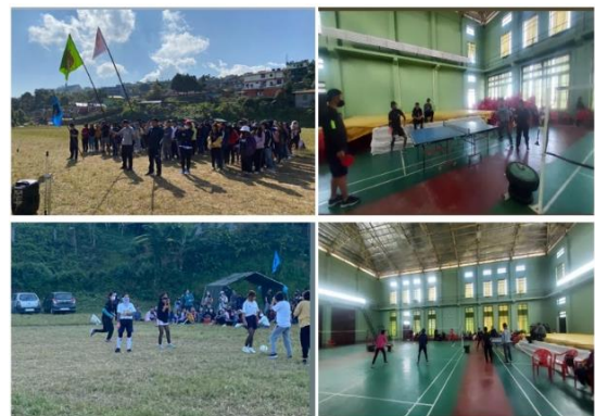
Annual Sports Meet 2021