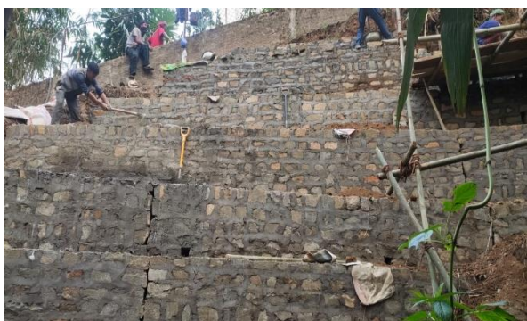
Protection wall along the boundary of the College building