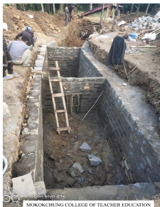
Fig: Reservoir Tank