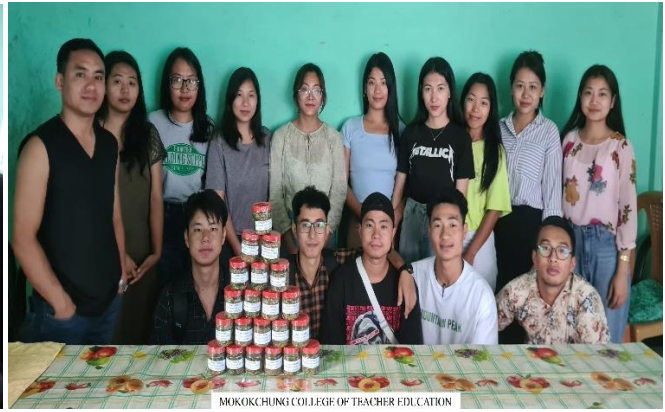
Fig: Skill Development Programme (Pickle Making Technician)