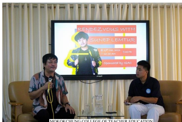
Fig: 'Rendezvous with Sunep Lemtur'