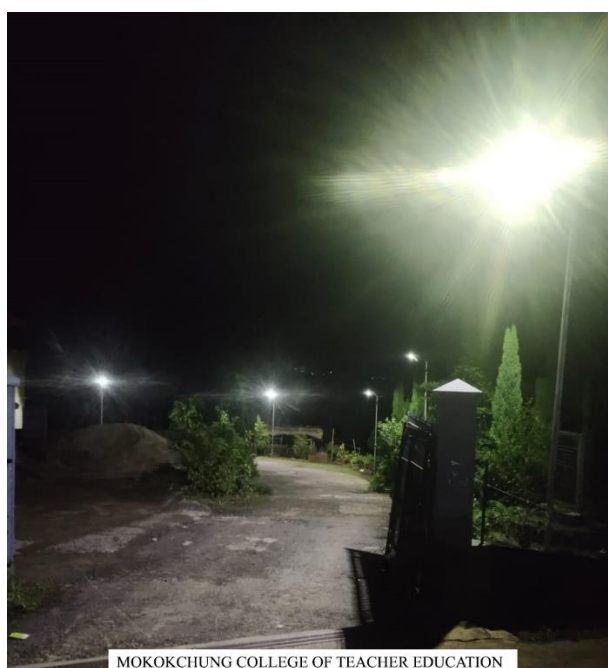
Fig: Solar powered street lamps