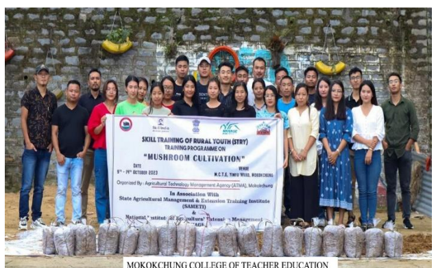
Fig: Skill Training of Rural Youth (STRY) Training Programme on "Mushroom Cultivation"