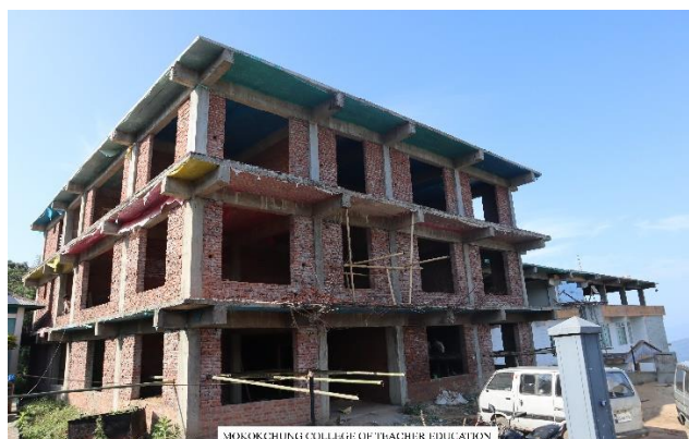
Fig: MCTE New Academic Building (under construction)