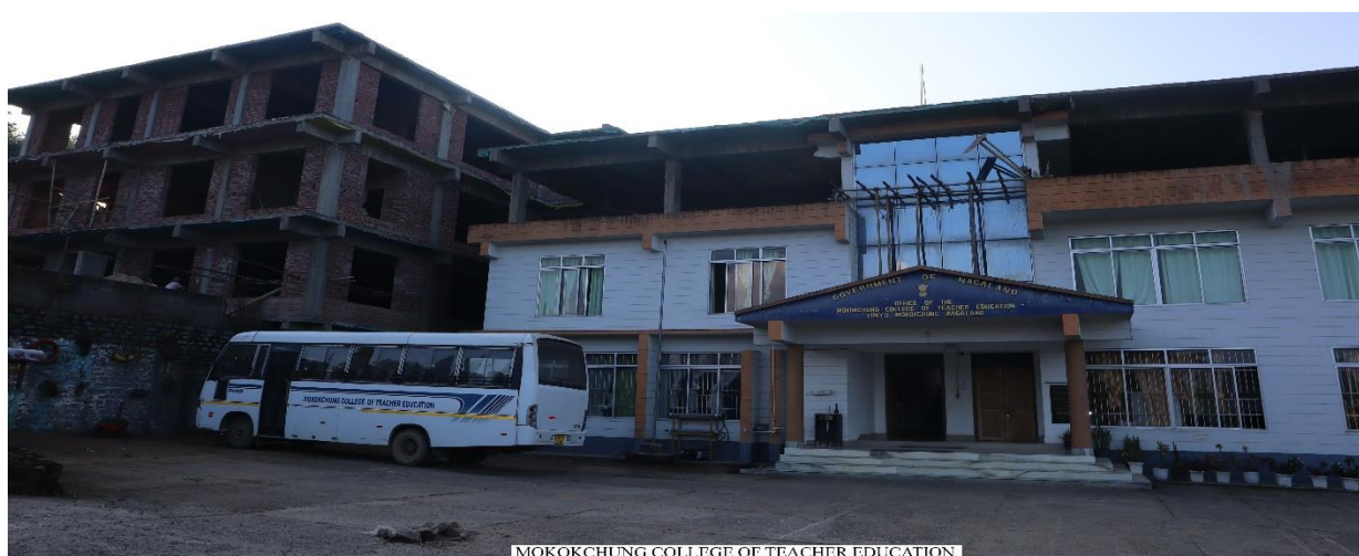
Fig: MCTE Administrative & Academic (Under Construction) Building