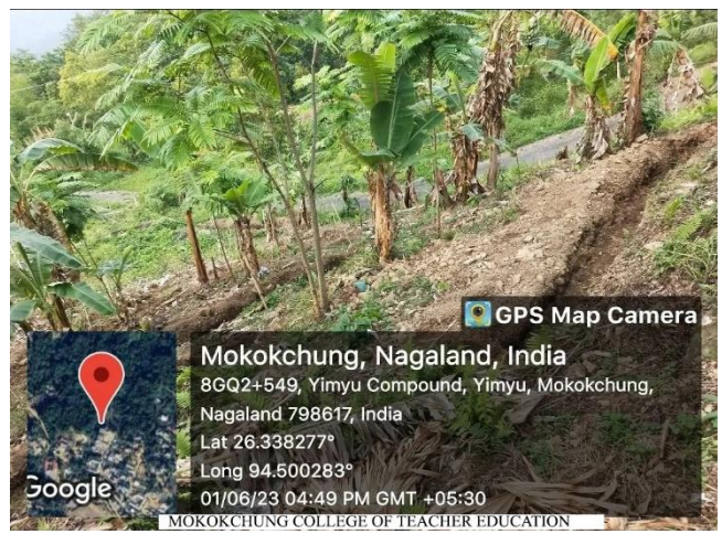
Fig: Contour trenching for ground water (JSA-CTR 2023)